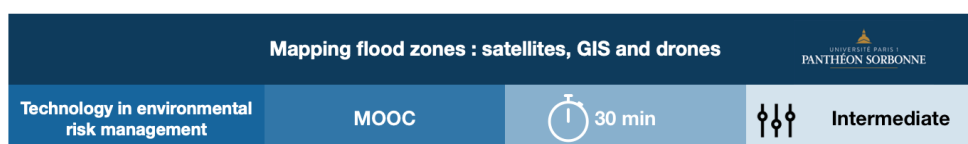
Figure 1: Example of a proposed Massive Open Online Course (MOOC), its duration and difficulty level.

Our proposed courses will have labels/tags permitting the learners to choose among the manifold courses that will be offered. Children will be divided into age classes (5-9 and 10-14), whereas adults can classify themselves as beginners, intermediates or experts.